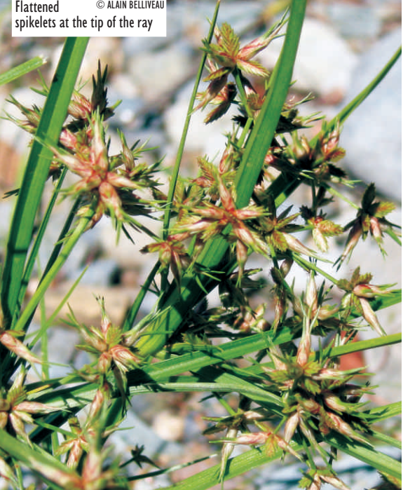
Spikelets sometimes develop into leafy shoots.